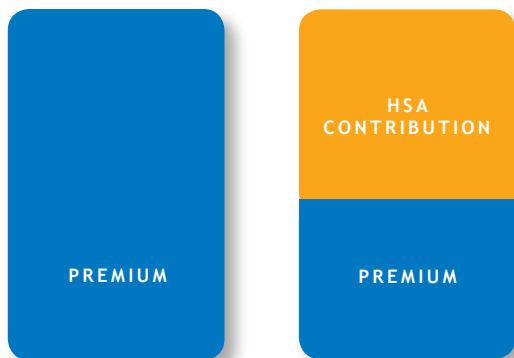
Conventional Plan Premium

The money you save on premiums with a high deductible plan can be put into your tax-sheltered HSA to grow tax-free year after year. You own the HSA funds and choose how to spend them.